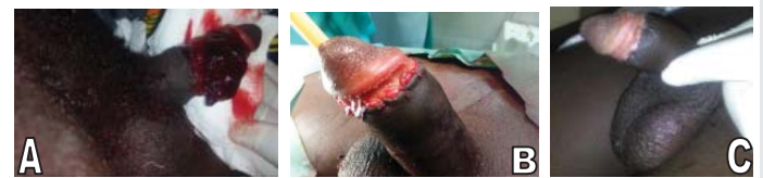
Figure 1: Case 1: Different Aspect of the penis.

Circumcision is a very common surgical procedure in the world. In West Africa, circumcision is common among both non-Muslim and Muslim. Demographic and health surveys show a very high prevalence in numerous Sub-Saharan African countries [3]: 92.9% in Benin; 91.6% in Ghana and 88.3% in Burkina Faso. There are some variations in each country and territory. In Cameroon the prevalence is 94% [4].