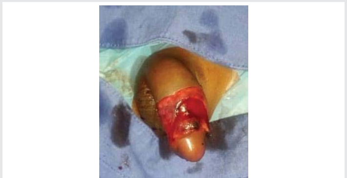
Figure 3: Case 3: intra-operative view of penile skin loss.

The Incidence of complications is variable, depending on whether or not it has been systematically recorded in health facilities [2]. This incidence of associated adverse events is thus estimated at 2 to 6 per 1000 male circumcision in neonates [5]. This rate is multiplied by 10 if circumcision is done in children over 10 years old. They are most often due [6] to a lack of knowledge concerning the precise anatomy of the penis and associated variations; we also cite an incomplete pre-operative assessment aimed at looking for contraindications to surgery (genital abnormalities, coagulation disorders); poor surgical technique, lack of proper training and inexperienced operator as we have seen in our series of cases reported. Atikeler [7], showed that the frequency of the complications from inexperienced circumcision practitioners are more frequent and could result in severe early phase complications such as life-threatening bleeding or some late phase disorders with lifelong negative influences.