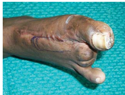
Figure 5: Figure showing defect right great toe of case 2.