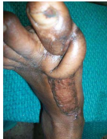
Figure 4: Follow up picture after 3 months.