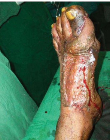
Figure 3: Final inset of flap with skin graft over donor site.