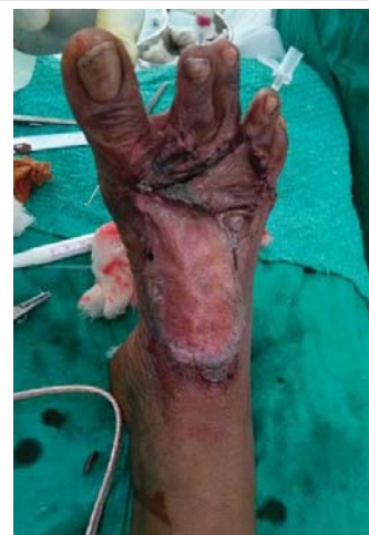
Figure 11: Final inset of flap with K wiring of the toes.

accident was the main etiology of the foot defect. Complications were noted in only two cases in the form of wound infections. In most of the cases, the post-operative period was remained uneventful despite incidence of wound infection that was noted in two of the cases, which were managed conservatively but all the flaps were healed completely.