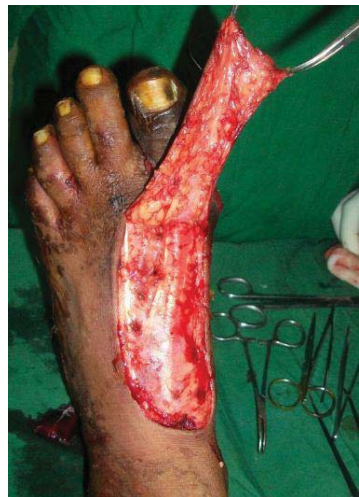
Figure 2: Raising of the flap.