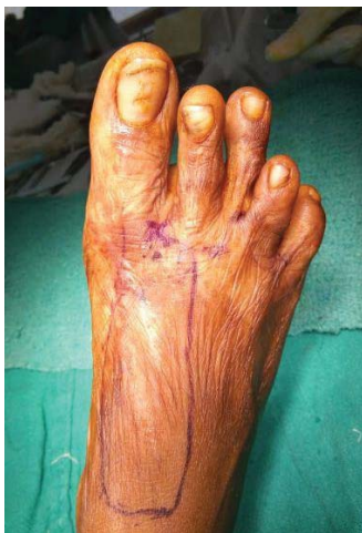
Figure 9: Figure showing post burn contracture of distal forefoot with contracture over toes in case 3 with flap marking.