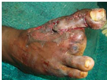
Figure 8: Final inset of flap with skin graft over donor site.