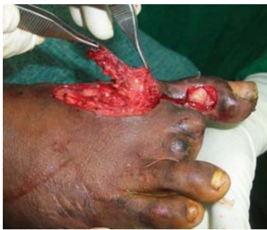
Figure 7: Raising of the flap.

Demographic data was evaluated. There were total 7 males (70 %) and 3 females (30 %). The average age of the patients was 34 years. The average defect size was 13.8 centimeter square. In 50% of cases main etiology was post burn contracture, in 20% it was crush injury and in rest 30 % of the cases, road traffic