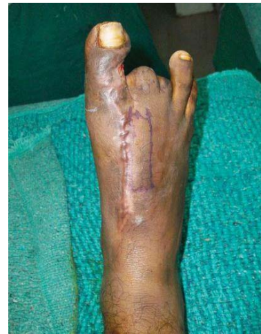
Figure 6: Flap marking.

Another case was of a 16 years old girl who presented with post burn scar with contractures of 2 nd , 3 rd and 4 th toes of right foot with hyperextension of metatarsophalangeal joints of those toes following a burn injury sustained 4 years ago. She was operated with the release of the contractures with K wire fixation of the toes and a distally based first web space flap based upon a perforator arising from DCA was raised to cover the raw area over forefoot resulting after the release of the contracture. Flap was survived well with no significant complication (Figures 9-11).