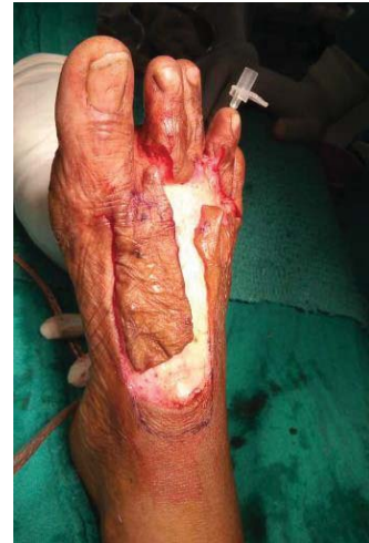
Figure 10: Contracture was released & flap was raised.