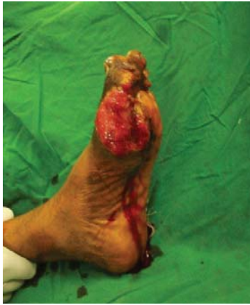
Figure 1: Figure showing defect in distal left foot and great toe of case 1.

trauma over the radial border of the great toe of right foot with a exposed proximal phalynx. Patient had post traumatic amputation of 2 nd and 3 rd toes. There again, a distally based first web space flap based upon a perforator arising from DCA was raised as an islanded flap to cover the defect. Again the flap was healed without any necrosis or infection (Figures 6-8).