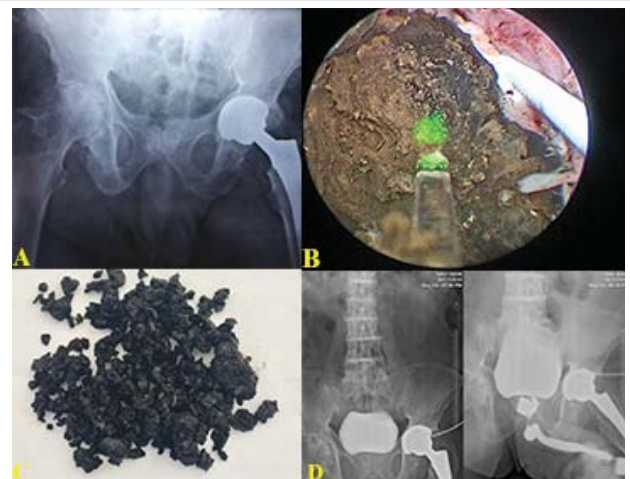
Figure 1: A. Xray Pelvis, B. Stone fragmentation with laser, C. Stone fragments, D. Post operative cysto-urethrogram.

55 years old male a known case of Alkaptonuria, recently underwent left hip replacement surgery. He developed urinary retention just after surgery. Per urethral catheterisation was attempted but could not be passed and hence cystoscopy was done. To our surprise cystoscopy showed a calculus in prostatic fossa that could not be pushed back into bladder and suprapubic catheterisation (SPC) was done. Xray Pelvis revealed speckled calcification behind pubic symphysis. Cystolitholapaxy was planned electively (Figure 1). Cystoscopy after 3 weeks revealed large prostatic urethral calculus of size of 2.5cms. As the stone could not be pushed into urinary bladder, it was fragmented with laser energy in prostatic fossa into small fragments. After 120 minutes of fragmentation, the fragments were pushed into bladder and washed out. Patient had a stable post operative period. Stone fragments were analysed which showed bilirubin and cholesterol. His urine was positive for alkaptonuria. Xray spine revealed multilevel intervertebral disc calcification with severe narrowing of the intervertebral disc spaces and associated anterior osteophytes along the lumbar vertebrae. His catheters were removed on POD 5 and was voiding with Qmax of 15ml/sec.