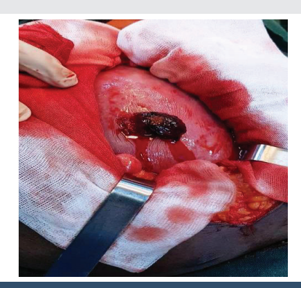
Figure 3: Uterine perforation and protrusion of the fetal scalp.