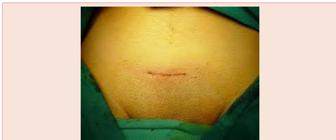
Figure 1: Suprapubic incision.

In patients receiving surgical treatment, the significant fact that we found is as the removal of the obstacle urinary flow associated with a strengthening of the band with the affixing of prostheses, has resulted in a reduction of hernia recurrence, especially in patients in group B. This indicates that the removal of the intra-abdominal pressure is effective and able to prevent recurrences hernias [5]. The affixing of the prosthesis thanks to the continuous evolution of materials and improved surgical technique, developing enhanced early hernia repair and the further reduction of the relapse rate. The simultaneous treatment of the two diseases in terms of satisfaction in patients treated has produced excellent results. Patients with one time interventions are not exposed to additional risks. Both