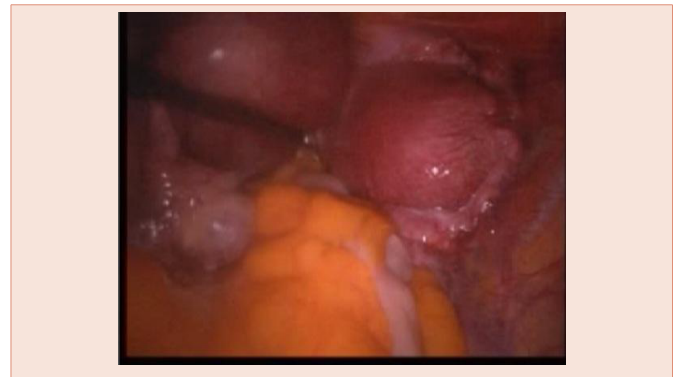
Figure 3: Laparoscopic view of a 6-cm rudimentary horn connected to the uterus with a fibrotic band.

RHP as a rare condition is accompanied with increased maternal complication and poor obstetrical prognosis. There are increased risks for abortion, malpresentation, intrauterine growth restriction (IUGR), intrauterine fetal death and placenta accreta with such condition [2]. Early diagnosis before uterine rupture can prevent maternal complication. In a systematic review study by Sujata et al., they have suggested ultrasound as the most common technique for