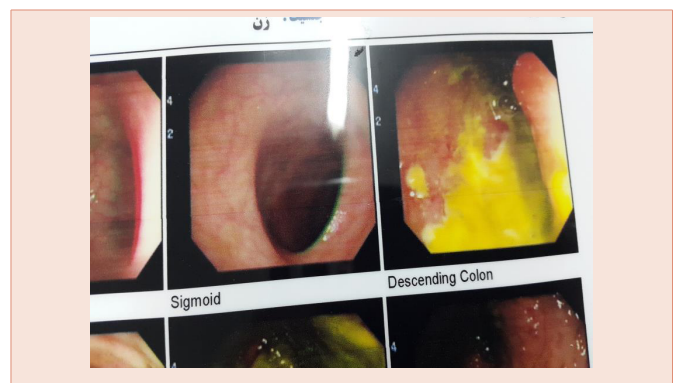
Figure 4: Colonoscopy appearance.