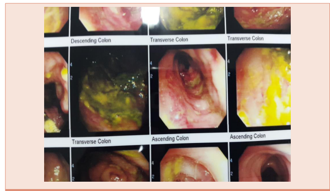
Figure 3: Colonoscopy appearance.

Pseudomembranous enterocolitis (PMEC) is a condition described by presence of pseudomembranes on the colonic or small bowel mucosa. This disease usually involves the colonic mucosa (PMC), yet it may sometimes appear in the small bowel (PMEC). These two conditions have a specific similar characteristic and that