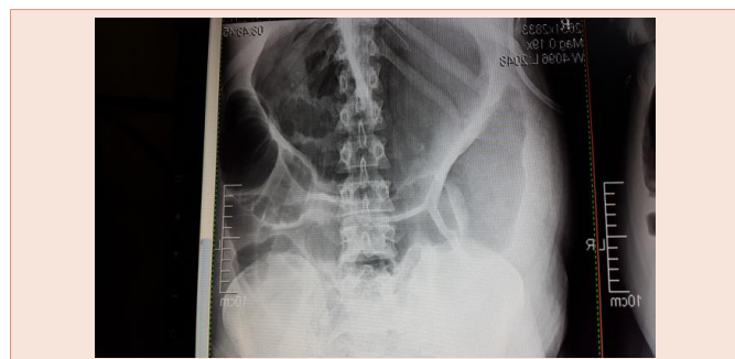
Figure 1: Bowel distention in administration.