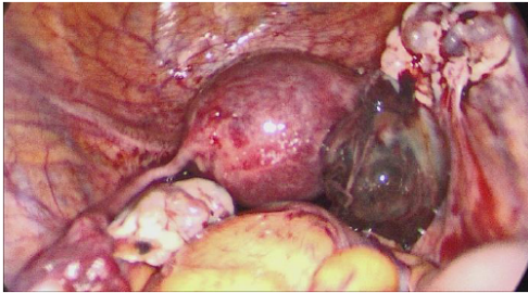
Figure 1: Right ovarian pregnancy.

Intrauterine contraceptive devices (IUD) are claimed to be a risk factor for EP [19], since 14-30% of patients with extra uterine EPs are said to have IUDs, while this rate for primary ovarian pregnancy is reported to be 57-90% [20-26]. One study showed the strong association between IUDs and ovarian EPs. According to this study,