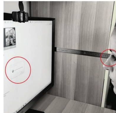
Figure 1: Recommended pose during computer work, with distances and inclinations, for eye safety (after [13]).

The particular advantages of OptoGuard are that distance monitoring is done automatically, is no longer the responsibility of the user, and does not require additional equipment, as the monitoring is carried out through the computer peripheral. The measurement technique is based on camera focus positions and clarity and doesn't request a reference, which distinguishes it from traditional methods. Regarding the warning method, it can be customized. Firstly, the OptoGuard was tested by displaying a pop-up message that can be closed by the user and, subjectively, ignored. The system lends itself to the further development of several types of visual warnings, being considered the constrictive type - which does not allow the resumption of work until the user returns in the visual safety interval, or the type of visual warning with emotional impact.