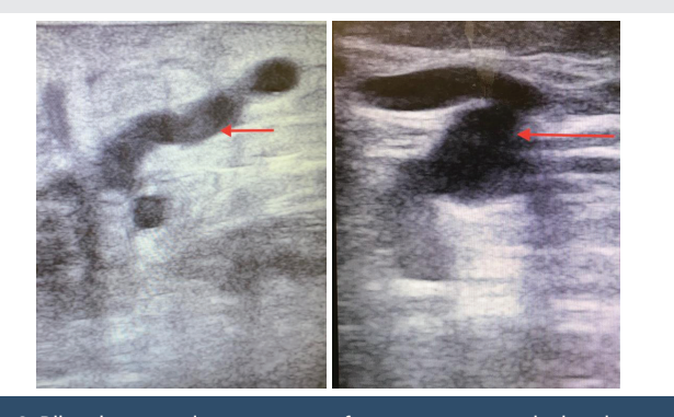
Figure 2: Dilated tortuous incompetent perforators as seen on duplex ultra sound.

Hauer described the method of SEPS, which eventually displaced the open surgical perforator ligation due to significant reduction in operative morbidity and shorter hospital stay