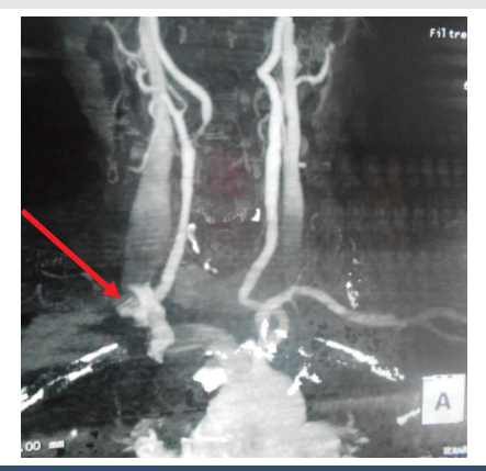
Figure 1: Angio CT of supra-aortic trunks showing pre-occlusive stenosis of proximal right subclavian artery.