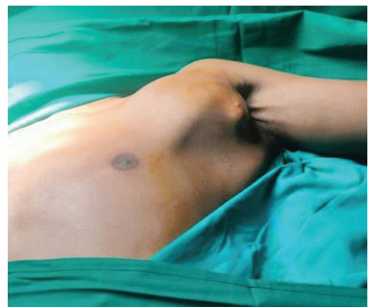
Figure 1: Swelling in left deltopectoral region extending to left axilla.

A 20-year-old male patient presented with an alleged history of stab injury to the left axillary region 20 days back that was treated primarily at a local hospital with skin suturing (Figure 1). There was no swelling when he visited the local hospital after his stab injury. After 10 days of stab injury, the patient noticed a pulsatile swelling in the left armpit which was initially small in size but increased rapidly within 10