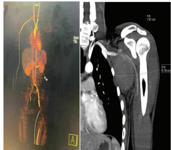
Figure 2: Computed tomography angiography showing subclavian artery pseudoaneurysm with 3 d reconstruction image.

Brachial, Radial, and ulnar artery pulsations were palpable and confirmed with a handheld Doppler. His postoperative recovery was uneventful. Pericardial drain and romovac drains were removed on the 2nd and 3rd Postoperative Day (POD) respectively and on the 5 th postoperative day, patients were discharged. After two weeks of surgery on clinical examination, the wound was healthy and the arterial pulsations of the left upper limb were palpable. Also, there were signs of any neurological impairment. Doppler study was done on follow-up visit was found to be normal.