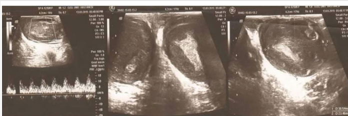
Figure 2: Gray-scale ultrasound images showing solid, ill-defined, hypoechoic masses in both testes replacing three-quarters of the normal testes parenchyma.