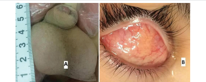
Figure 1: A: Photograph showing testicular enlargement. B: Photograph showing conjunctival hyperemia and yellowish nodules in the eye.

Laboratory examination revealed a white blood cell count of 5,350/mm 3 with a normal differential; a hemoglobin level of 13.2 g/dL; an erythrocyte sedimentation rate (ESR) of 71 mm/h (normal range: 3–13 mm/h); a C-reactive protein (CRP) level of 7.62 mg/dl (normal, < 0.8 mg/dl); follicle-stimulating hormone and luteinizing hormone levels of 0.23 and 0.1 mIU/mL,