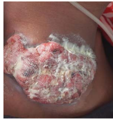
Figure 1: Right supraclavicular Fungating mass.

The patient was admitted with the working diagnosis of Primary Cutaneous Anaplastic Large Cell Lymphoma with super Infection; she was started on Dexamethasone 8mg IV TID to relieve the obstructive symptoms & was put on Ceftriaxone, & Metronidazole to treat the super Infection. After seven days of steroid & Antibiotics treatment, the patient was fever-free, whitish discharges cleared, the size of the mass significantly reduced (Figure 2 ) & the obstructive symptoms disappeared. After treatment of the bacterial superinfection, it was planned to treat her with Radiotherapy but was not possible because of technical difficulties then the patient was started on weekly