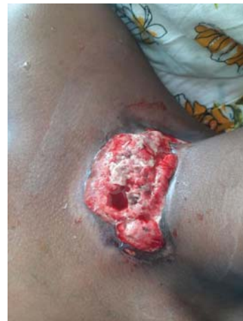
Figure 2: Supraclavicular mass -7 days after Steroid & Antibiotics.

Methotrexate 7.5 mg PO Bid with Folic acid 5 mg daily, and the patient was appointed for further follow-up.