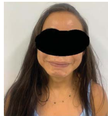
Figure 1: Patient with the inverted face sign that is pathognomonic of Ochoa Syndrome.

He has 8 siblings, 1 male, 7 females (1 half-sister on his mother's side) (Figure 3). Of these, four cases of Urofacial Syndrome (Ochoa's) have already been diagnosed in the family, including the patient, diagnosed at the age of 7, two sisters diagnosed since birth, and the half-sister who, although she is older, for being practically asymptomatic from the urological point of view, the diagnosis was confirmed only after the patient. The patient denies knowledge about parental consanguinity (both parents are already deceased).