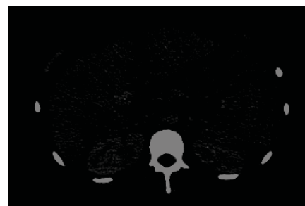
Figure 1: Portal Vein Thrombosis.

In this study, we intend to present the case of a patient with septic thrombosis of the portal vein secondary to appendicitis, who underwent exploratory laparotomy with appendectomy