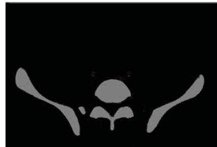
Figure 3: Ileocecal Collection.

up for esophageal variceal surveillance and remained well and without complaints.