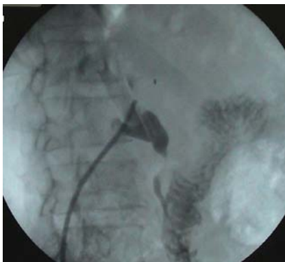
Figure 2: The abrupt termination of common bile duct in T-tube cholangiography.