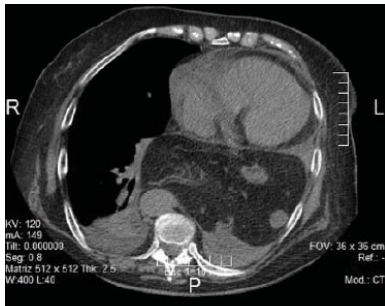
Figure 1: Thoraco-abdominal CT scan showing the incarcerated stomach in their fundus, compressing the hearth to the anterior thoracic wall.

image in front of the hearth. CT scan was requested reporting a giant hiatal hernia of 9 cm in diameter, with stomach, transverse colon and spleen in the left thorax (Figures 1,2). Considering the laboratory findings without sepsis data and the hiatal hernia with incarcerated organs in the thorax, the diagnosis of cardiogenic shock secondary to compression was established and a laparotomy scheduled. By the cardiogenic shock with the use of norepinephrine a laparoscopic approach was discarded initially and a laparotomy was performed finding the stomach, transverse colon and spleen incarcerated in the thorax, they were reduced by a hiatal hernia of about 10 cm. of diameter without problems (Figures 3,4). A Nissen fundoplication was performed, with adequate response and remission of cardiogenic shock only six hours after surgery. A chest X-ray 24 hours after surgery shows no alteration (Figure 5). After 48 hours of hospital stay and oral feeding, the patient was discharged uneventfully. At 4 months after surgery she stills asymptomatic.