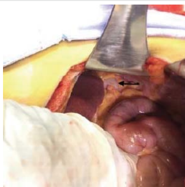
Figure 3: Incarcerated transverse colon (Black arrow).