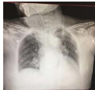
Figure 5: Control chest X-ray immediately after surgical correction without bowel loops or gastric bubble in left hemithorax.