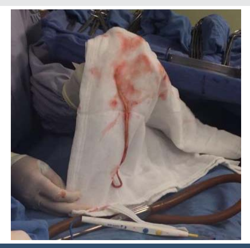
Figure 2: Adult Ascaris Lumbricoides worm obtained from inside the abscess