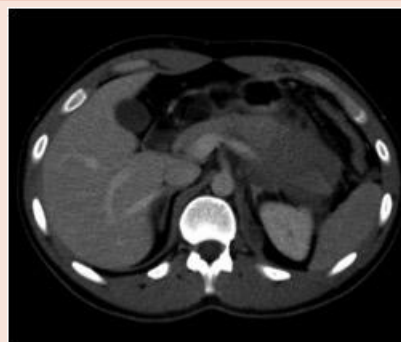
Figure 1: CT: Complete transection of pancreas.

Approximately the 65% of pancreatic lesions occurs in the neck and body the remaining ones, take place at the head and tail [3]. Around the 90% of the patients with pancreatic trauma shows up concomitant small bowel lesions, and because of the anatomic