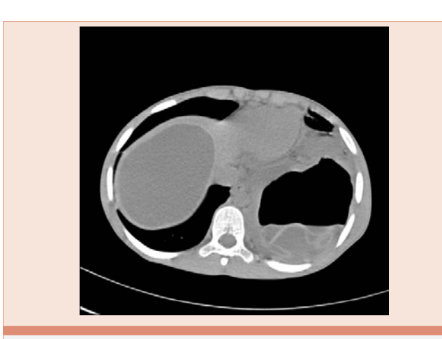
Figure 3: Intact on the right, perforated hydatid cyst on the left.

The complications in ruptured hydatid cysts are seen more frequently compared to intact cycts hydatics [8]. Complications of a ruptured cyst of can be ordered as: asphyxia (membrane and cyst fluid expectoration), hemoptysis, anaphylactic shock, respiratory failure, pneumonia, destroyed liver, bronchiectasis, pulmonary abscesses, empyema, pneumothorax, and aspergilloma in the cyst cavity (Figure 5). Additionally, a perforated hydatid cyst can cause extrapulmonary destruction in the sternum and ribs.