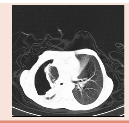
Figure 6: Collapsed lung due to the giant perforated hydatid cyst on the right.

In our series of 412 cases where surgical procedures were examined and in our series of 176 cases where the complications related to perforated hydatid cysts, the rate of pleural complication