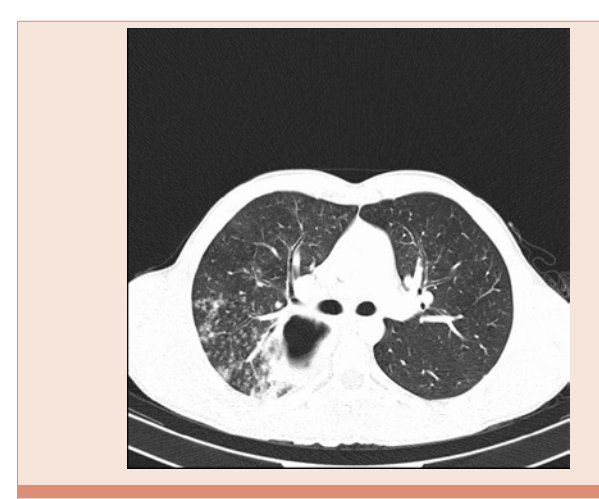
Figure 5: Perforated hydatid cyst on the right and pneumonic infiltrations on the peripheral parenchyma tissue.

Rupture is a predisposing factor for infection, which is the most serious complication. The frequency of this complication is reported between 30-90%. Infected hydatid cysts can show a thick and opacifying wall structure, similar to lung abscesses, and include air-liquid level and a pneumonic consolidation area can surround them [13]. When the cyst cavity is involved in the bronchial system, this prepares the environment for bacterial and fungal infections. The pneumonia in the peripheral parenchyma after an infection of the cyst cavity, bronchiectasis in the delayed cases and a destroyed lung are the pathologies encountered [8,10,11]. In the case that the cyct is infected, immune complex disease, glomerulonephritis, nephrotic syndrome, and secondary amyloidosis can develop [13].