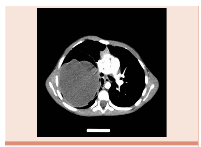
Figure 1: Giant hydatid cyst in the right lung.

Since the pericyste in the lung does not develops well as in the liver, it is more likely to rupture. An increase in the size of the cyst, which causes an increase in intrathoracic pressure, due to factors such as trauma and cough, can cause the cyst rupture [11]. The pressure inside the cyst is proportional to the cube of the diameter of the cyst. Therefore, even the smallest increase in diameter of the cyst increases cyst pressure to a serious degree and causes a large rupture risk.