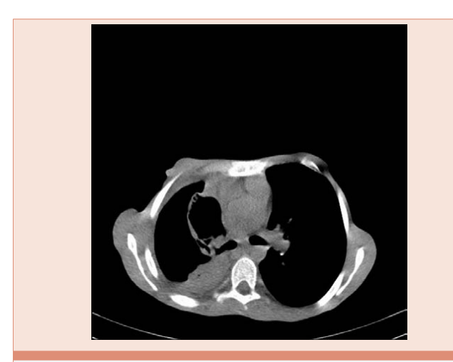
Figure 7: Perforated hydatid cyst and pleural effusion on the right.

was 26.94% [7,12]. 22.77% of 176 cases with perforated hydatid cyst were detected to have pneumothorax. Two of these (1.13%) were tension pneumothorax. Pleural effusion in 36 (20.45%) cases, empyema in 35 (19.88%) cases, and pleural thickening in 17 (9.65%) cases were detected [12].