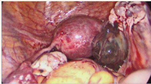
Figure 1: Right ovarian pregnancy.

Intrauterine contraceptive devices (IUD) are claimed to be a risk factor for EP [19], since 14-30% of patients with extra uterine EPs are said to have IUDs, while this rate for primary ovarian pregnancy is reported to be 57-90% [20-26]. One study showed the strong association between IUDs and ovarian EPs. According to this study,