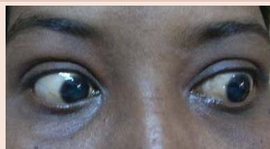
Figure 3b: Ocular movements in levoversion.