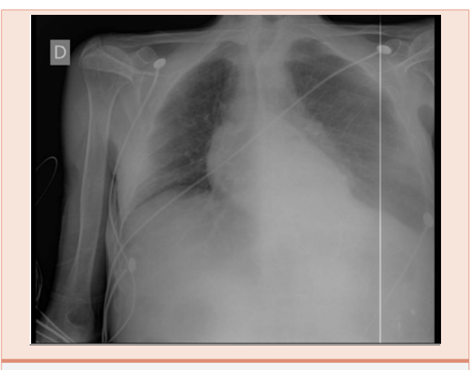
Figure 1: Thorax radiogram 48 hours before ICU admission.

In the routinary chest radiography a left white lung was observed. A fibrobronchoscopy was performed ruling out atelectasis associated with tracheal intubation. A thoracic tube was inserted, draining 4250 millilitres of transudate liquid in 10 hours. Despite of this, a new radiography showed no improvement in hydrothorax (Figure 1).