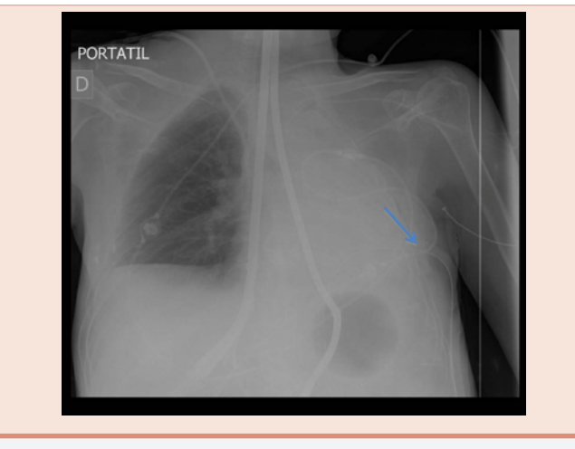
Figure 3: Control thorax radiogram after chest tube insertion (blue arrow).

In order to treat both complications, it was decided to transfer the patient to our reference centre to perform a TIPS, that couldn't be achieved because a portal thrombosis was discovered in abdominal ultrasonography (Figure 2).