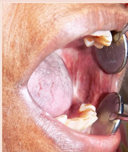
Figure 2: Oral Submucous Fibrosis presenting as generalised blanching of oral mucosa with palpable fibrotic bands in buccal mucosa.

The squamous papilloma is a common benign oral epithelial neoplasm [1]. Papilloma usually presents as an exophytic, painless papillary mass [2]. Oral Submucous Fibrosis is a premalignant condition [3]. A 45 year old female patient presented with growth in inner side of left cheek region. Patient had history of gutka chewing for past 6 years. On intra oral examination, the growth was pinkish, strawberry like in appearance with a papillary surface in the right buccal mucosa (Figure 1). Generalized blanching of oral mucosa was present (Figure 2). The growth was not tender on palpation and firm in consistency. The growth was pedunculated with no induration or bleeding on palpation. Palpable fibrotic bands were present in the buccal mucosa. The patient was provisionally diagnosed to have papilloma of right buccal mucosa with oral submucous fibrosis. A differential diagnosis of verruca vulgaris, verrucousleukoplakia and condylomaacuminatum was considered. After investigations, the patient was subjected to excisional biopsy. Excisional biopsy of the