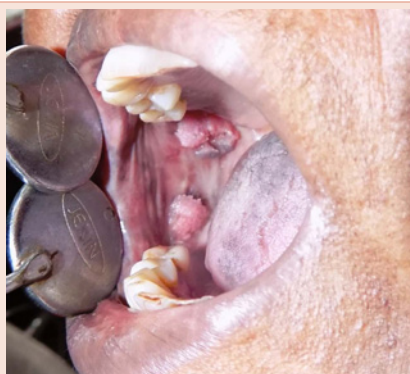
Figure 1: Squamous Papilloma of buccal mucosa.