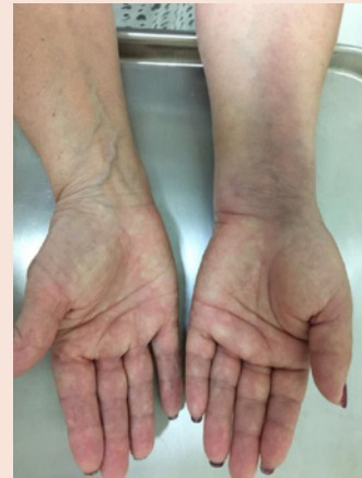
Figure 2: Thumb, thenar zone, volar forearm, and wrist pain in addition to erythematous and edematous two days after sheep bite.