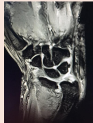
Figure 3: Magnetic resonance image, showing increased fluid in radio-carpal and inter-carpal joints by septic arthritis and laminar cellulitis as secondary effects from a sheep bite.