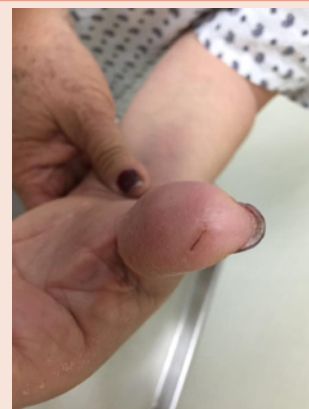
Figure 1: Lacerations on the anterior surface of the fingerprint part of the thumb; the wound was shaped regularly with no secretions caused by the sheep bite.

a sheep bite on her thumb. The sheep was sick because a dog bite, the dog has been properly vaccinated. Patient stated that the first symptoms, with redness of thumb fingerprint, swelling and pain appeared 12 hours after the bite, over time (24 hour) they became worse. Clinical examination revealed a little lacerations on the anterior surface of the fingerprint thumb (Figure 1), the wound was regular in shape without secretions. The thumb, volar forearm and wrist were painful, erythematous, and edematous. (Figure 2) There was no evidence of conditions and past procedures that may put the patient at greater risk, such as diabetes, liver disease, immunosuppression or splenectomy. The patient was no febrile and she was feeling well except for important pain (in 8 in 0-10 VAS). There were no clinical signs of systemic infection. Laboratory results showed: PCR 201 mg/L,