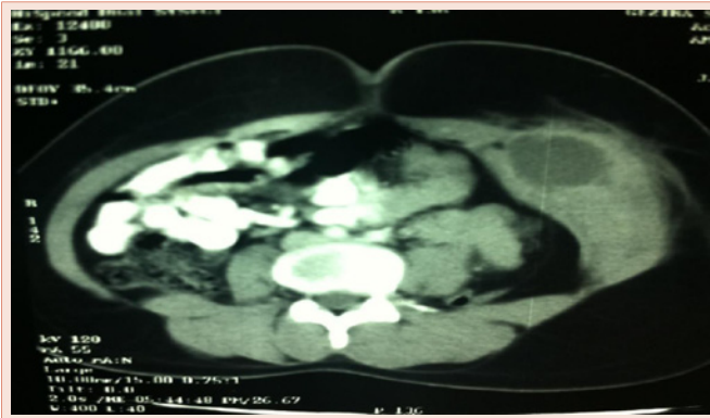
Figure 2: Focal cystic collection seen in the anterior abdominal wall of the left iliac fossa with mild peripheral enhancement (white arrow).