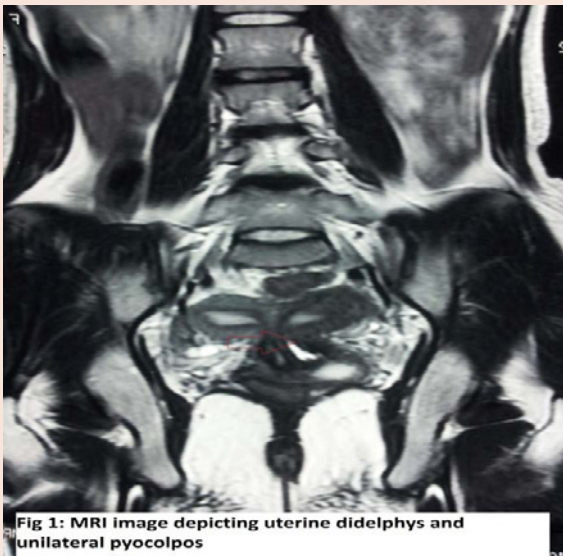
Fig 1: MRI image depicting uterine didelphys and unilateral pyocolpos