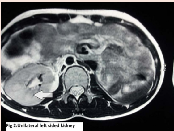
Fig 2: Unilateral left sided kidney